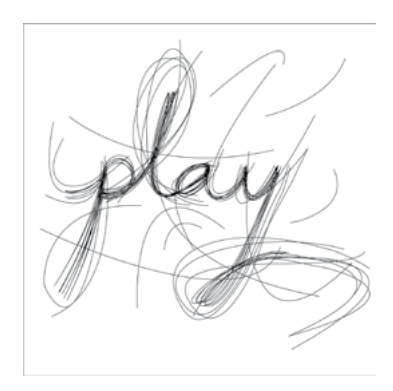
FIGURE 5: Expressive words made with lines. How can simple design principles like lines be used to convey complex feelings and emotions about different ideas?

images feel static? Why? Which images make use of positive space? Negative space? How does that change how students respond to them and what they see?